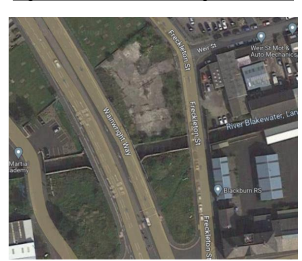
Figure One - Satellite image of the site

3.1.1 The application site is two plots of vacant land located within the defined inner urban boundary of Blackburn, Blackburn Town Centre and the Freckleton Street Employment Land Allocation. The River Blakewater divides the two parts. The north part is currently covered in hardstanding and grasses with a number of trees and shrubs interspersing its peripheries. The south part is currently covered in grasses with trees and shrubs found adjacent to the river. Signage and a CCTV column is also found within that part.