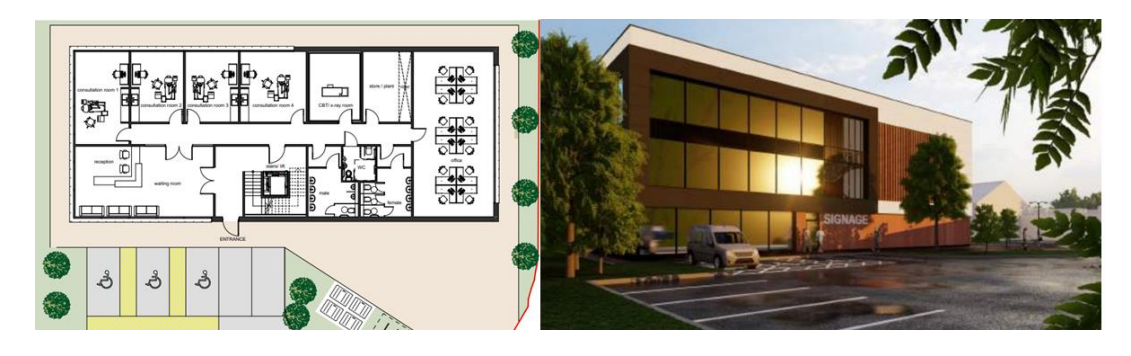
Figure Four – Proposed Ground Floor Plan and CGI Image

3.2.2 The proposed health centre would have a footprint of circa 400 square metres and a flat roof 11.7m in height. Cladding of various colours and styles, terracotta render and a black aluminium curtain walling system would be used to externally finish the elevations. A black aluminium door would also be installed to the south elevation. Any new areas of hardstanding would be surfaced in tarmac with block paving used for the pedestrian areas around the health centre. Receptions, waiting rooms, consultation rooms, toilets and offices would be provided on all three levels of the building.