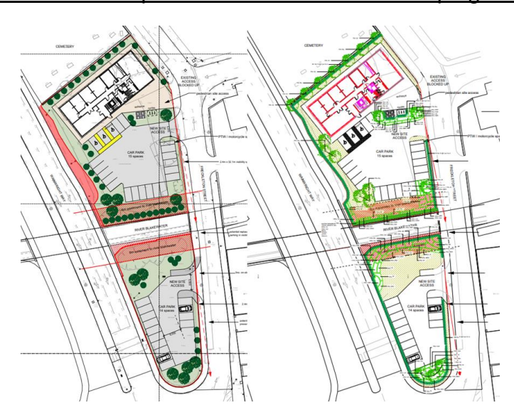
Figure Three – Proposed Site Plan and Landscaping Scheme

3.2.1 As detailed above, this application seeks full planning permission for the erection of a three-storey health centre providing services for dental care, an opticians and hearing assistance — Use Class E(e). The building would be erected within the north part of the site. A 21 space carpark would be provided adjacent complete with 3 mobility impaired spaces, motorcycle parking spaces, 3 covered cycle storage racks and bin storage areas. New pedestrian and vehicular access points would be formed. A further 14 spaces would be provided within the south part of the site. A new vehicular access point would be formed with a 2m footway either side. Supplementary landscaping would also be provided throughout the site in the form of native and ornamental tree species, low-lying shrubs and grassed areas.